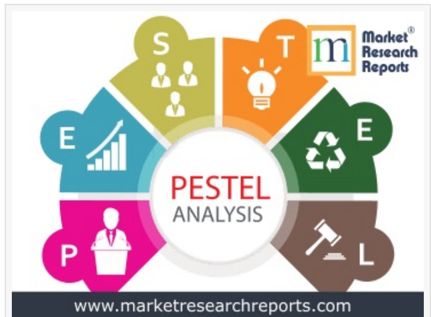
Country PESTEL Analysis Reports

Country SWOT analysis used to identify and categorise significant internal (Strengths and Weaknesses) and external (Opportunities and Threats) factors faced by nation. SWOT analysis provides information that is helpful in matching the country's resources and capabilities to the