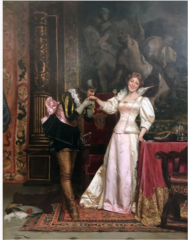
Elegant oil on canvas figural rendering by Charles J.F. Soulacroix ($60,000).

Rounding out just some of the auction's top lots, a 20th century Dresden Volkstedt porcelain figural