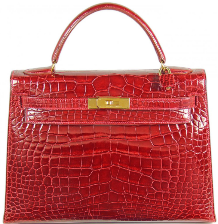
Hermes shiny red alligator Sellier Kelly women's handbag ($21,600).

This press release can be viewed online at: http://www.einpresswire.com