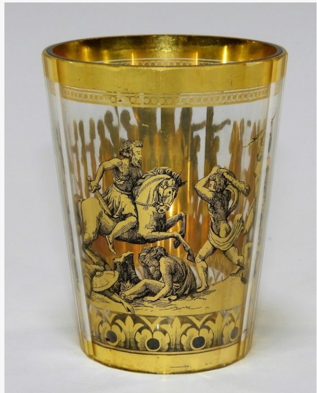
Russian Potemkin Imperial Glass Works faceted gilt beaker, made circa 1780.

This press release can be viewed online at: http://www.einpresswire.com