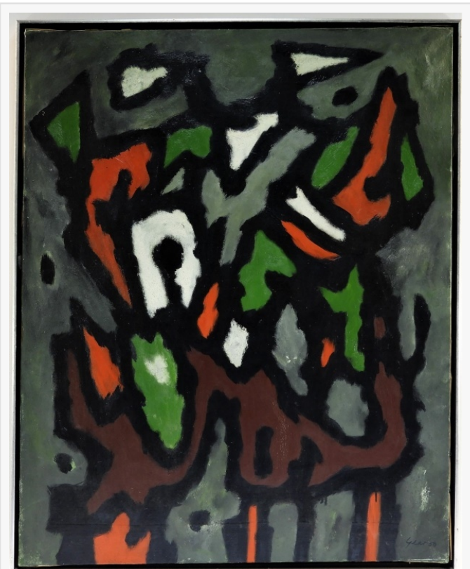
Oil on canvas painting by William Gear (U.K., 1915-1997), titled Paysage, Mai 50.

The William Gear painting depicts an amalgamation of abstracted naturalistic forms in an earthly palette, over a gray background, and is housed in a 33 inch by 26 ½ inch frame. It's signed and dated in the lower right corner and on verso and is a fine example of Gear's work embodying his long and stellar career. Bruneau & Co. has assigned it a pre-sale estimate of $10,000-$20,000.