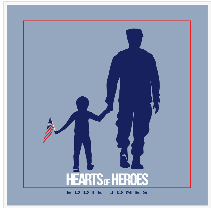
"Hearts of Heroes" single cover

Purchase "Hearts of Heroes" on iTunes: <a href="https://itunes.apple.com/us/album/hearts-of-heroes-single/1306514000">https://itunes.apple.com/us/album/hearts-of-heroes-single/1306514000</a>