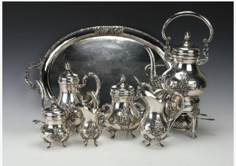
Beautiful German-made sterling tea service, all on a silver tray.