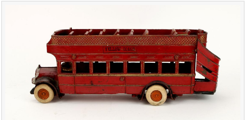
Vintage cast iron toy double-decker bus with "Yellow Coach" on the side.

A large, 18th century cherry wood serpentine form knife (or cutlery) box with a slant top and an exterior having an overall craquelure finish with an inlaid shell design in the center, is expected to sell for $800-$1,200; while back in the East, a Japanese silver, leather and bone tobacco pouch dating from the Meiji period (1868-1912), with embossed and painted leather on the exterior in dragon forms and an interior having painted suede dragons, is expected to command $600-$900.