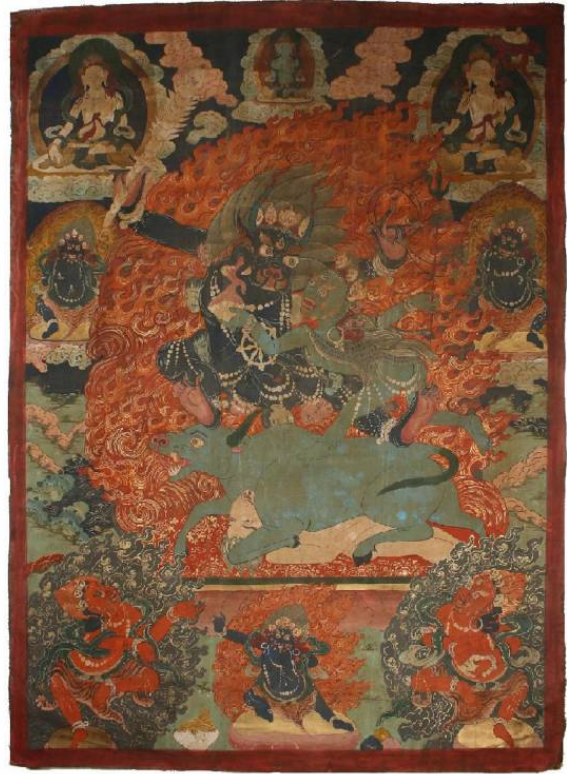
Large and beautiful 18th century Tibetan Buddhist thangka (or religious painting).

Asian jewelry will feature an amber-colored Chaozhou piece with large jade beads and turquoise bead pendants with tear-drops of dark pink stone, and a long, oval green jade center pendant (est. $1,000-$1,500). Also sold will be a Chinese silver and enamel belt buckle with repousse dragon, accents in a rainbow of colors and detailed dragons against a flaming sky (est. $1,000-$1,500).