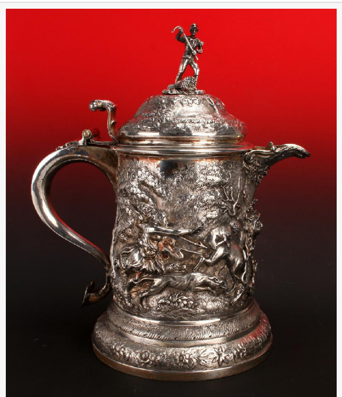
Circa 1860s English repousse pitcher by R&S Garrard of London, 8 inches tall.

Those are just a few items in a 474-lot auction where Asian objects will be sold along with items from the Western culture – hence the title East Meets West. Internet bidding will be provided by LiveAuctioneers.com, Invaluable.com and HiBid.com, plus the Converse Auctions website, at www.converseauctions.com , and via Google Play (for Android) and the App Store (for iPhone).