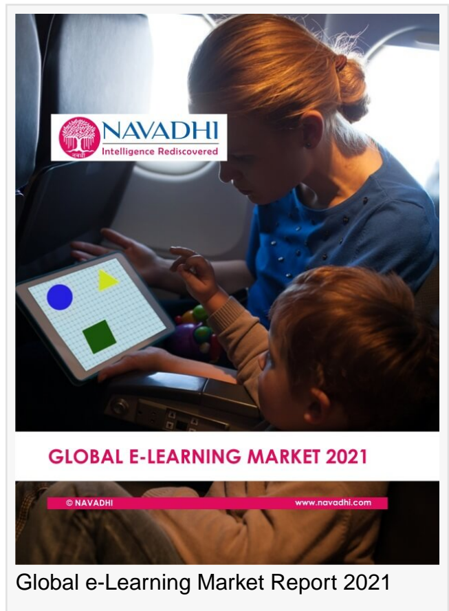
Global e-Learning Market Report 2021

8 major companies have been covered in this report for accurately studying the market and understanding the need of the market, and to determine the growth drivers and inhibitors and trends followed in the Global E Learning Market.