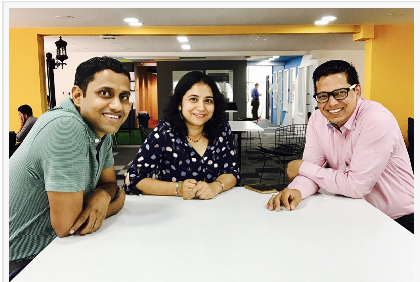
Minjar is Now an Audited Next-Generation Managed Service Provider for AWS

SANTA CLARA, CALIFORNIA, UNITED STATES, November 14, 2017 /EINPresswire.com/ -- Minjar , leading cloud solutions provider and one of the early AWS Premier Consulting and Managed Service Providers, announced that they have successfully renewed their membership for the elite league of audited AWS Next-Generation MSP Partner after completing a rigorous validation. Minjar completed an audit by the AWS team covering how they plan, build, integrate, operate, and provide security on AWS to enterprises.