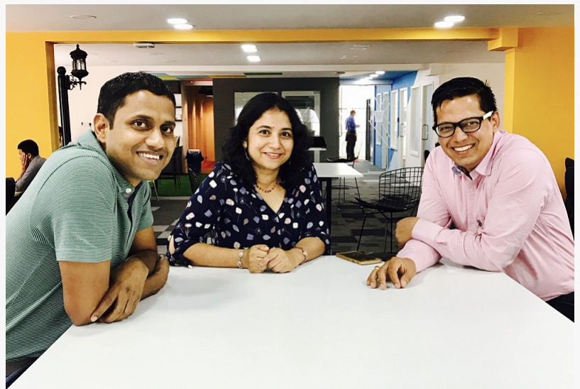
Minjar is Now an Audited Next-Generation Managed Service Provider for AWS

As a part of the audit process, the Amazon Web Services team carefully monitored the various services and solutions provided by Minjar to its clients. The company was validated on various aspects of documentation, next-generation monitoring tools, and technology implementations, and benefits offered through Minjar's SaaS platform Botmetric for its managed services customers.