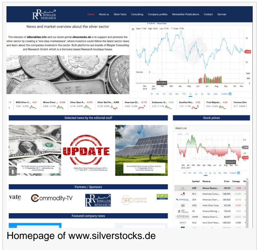
Homepage of www.silverstocks.de

Sign up for our free newsletter on the website: http://silverstocks.de/newsletter-publications/