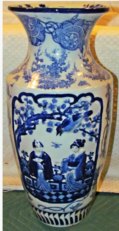
Large (19 inches tall) and beautiful Oriental vase.