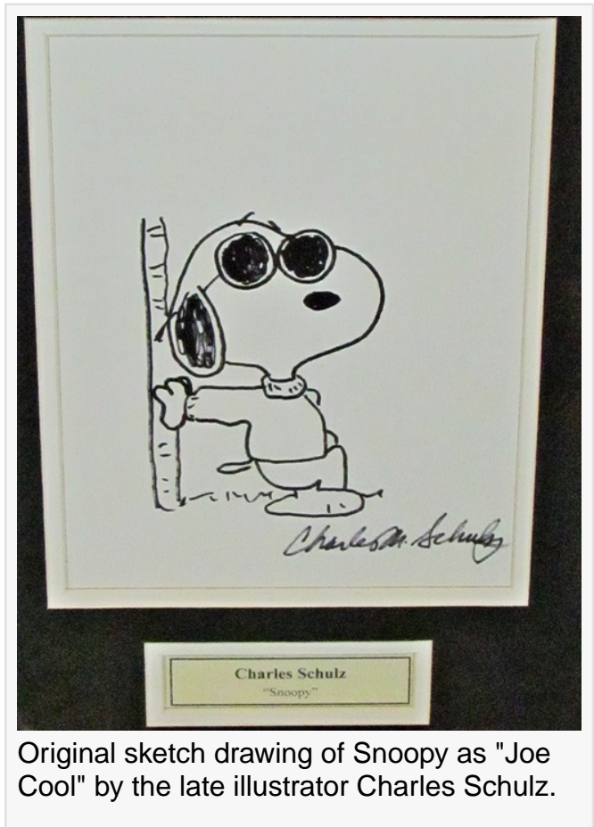
Original sketch drawing of Snoopy as "Joe Cool" by the late illustrator Charles Schulz.

“Auction Action on BCTV is probably the only true auction-related reality show on television, unlike programs like Storage Wars and a few I could name that are promoted as reality TV but in fact are highly staged,” Mr. Howze said. “Our show is real items being bid on by real people in real time. There’s no script and not even a set time limit. It doesn’t get any more real than that.”