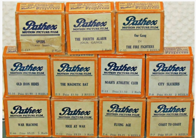
Early Panthex films including Our Gang , Charlie Chaplin and more will be sold.

Numismatists will be happy to know that coins will be sprinkled into the auction every third lot, beginning with lot #23a (a group of nine early U.S. cents – a 1908-S Indian head and the rest early Lincoln head cents). Most of the coins in the auction will be U.S. silver coins, to include some Morgan silver dollars, very popular with collectors. Most coins will be sold as single lots.