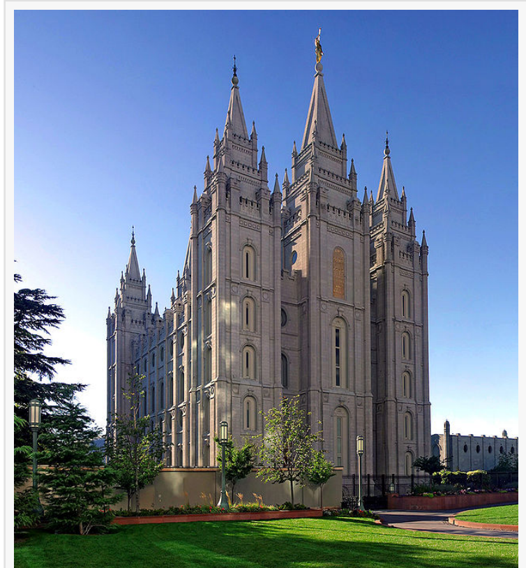
Mormon Tabernacle Salt Lake City, UT

According to Litchfield Associates, in 1988 the Quorum of the Twelve, the board of directors of the Mormon Church headquartered in Salt Lake City, Utah, thought the same. The Quorum informed Church management that the Alexander Scourby narration of the King James Bible is the best narration in the World, and wanted to make that narration available to Church members as the Church's official Bible narration; and directed Church management to acquire the necessary rights to make that happen.