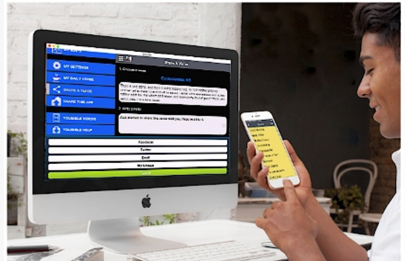
For Mobile Devices, Tablets or Desktops.