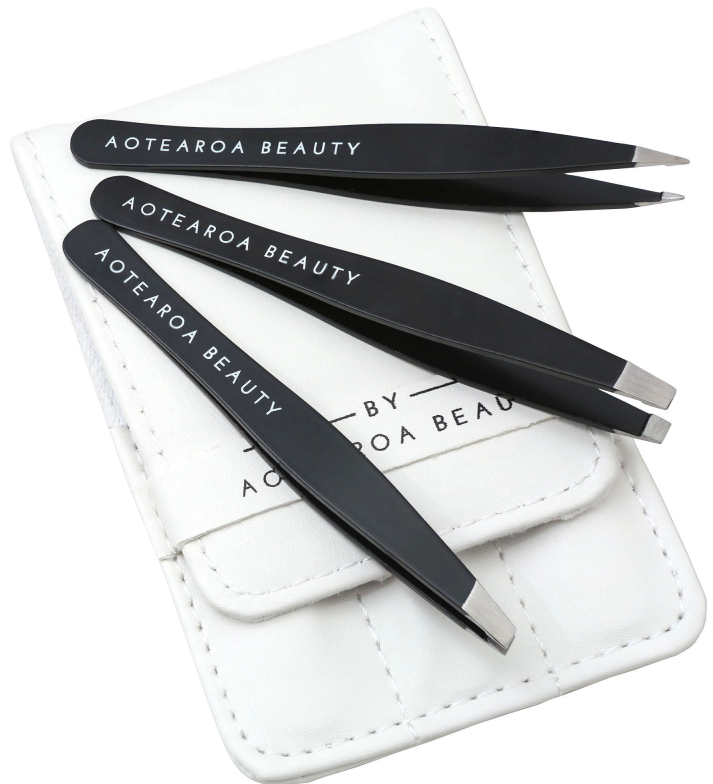
Tweezers White kit

This press release can be viewed online at: http://www.einpresswire.com