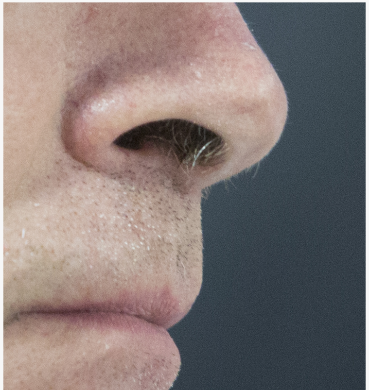
Father of the bride needs to trim all those stray hairs