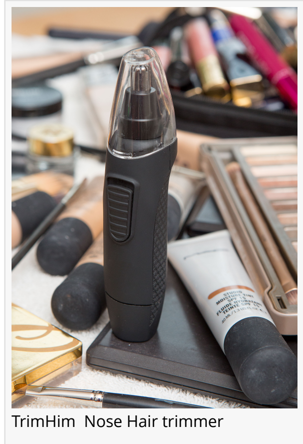
TrimHim Nose Hair trimmer

One of the most important aspects of facial hair trimming is comfort. Nobody likes the feeling of a trimmer pulling at their hair, the sharp pinch makes for an uncomfortable experience, and it can be exhausting when you can't seem to get rid of that one piece of stray hair. That is why TrimHim is designed to operate with precision and provide the most comfort possible when trimming your hair, whether your trying to look good for an event, or even quickly trim your hair minutes before leaving for work, TrimHim's stainless-steel circular blade system will guarantee that you are free of discomfort and its ergonomic body ensures ease of use.