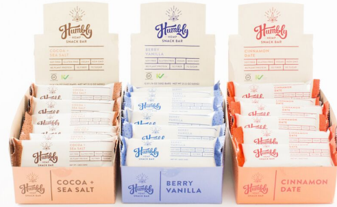
Humbly Hemp Snack Bars

Right On Brands, Inc., a Santa Monica California based consumer and media company specializing in