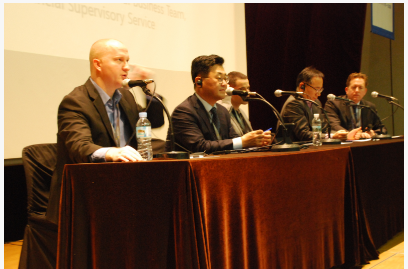
Inside FinTech panel discussion

Inside Fintech represents every sector of the financial market. The event, which is to be held at