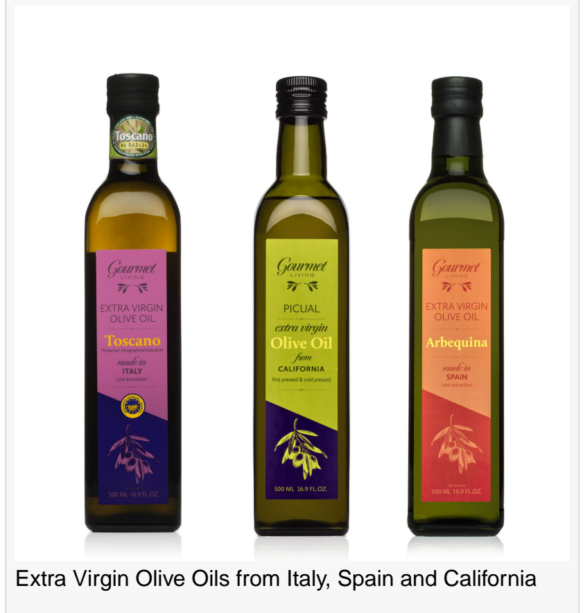
Extra Virgin Olive Oils from Italy, Spain and California

This press release can be viewed online at: http://www.einpresswire.com