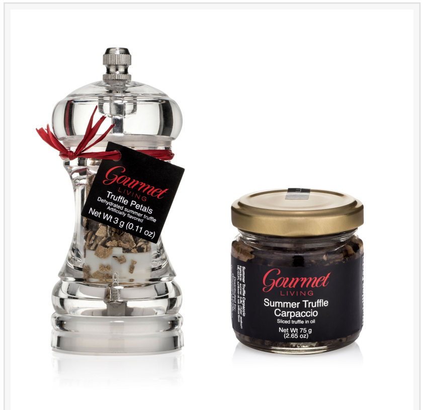
Truffles 2-Ways from Gourmet Living

Sheila May Gourmet Living +1 203-629-1530 email us here