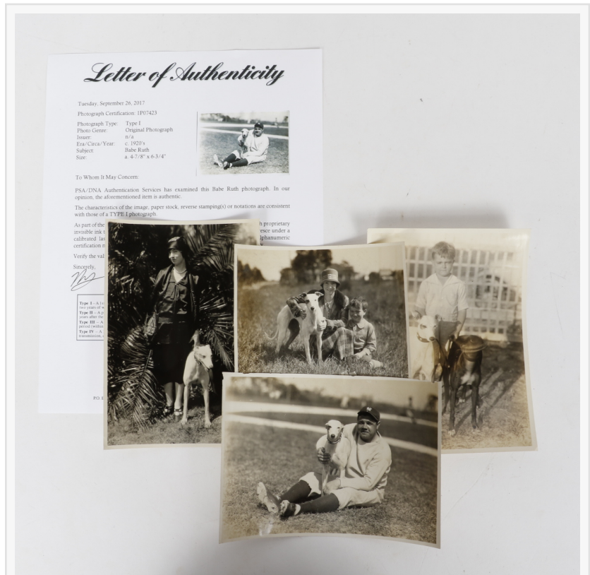
Photos of Babe Ruth, greyhound Hazel and members of Hazel's family.

To learn more about Ripley Auctions and the upcoming auction planned for Saturday, December 2nd, at 11 am Central time, please visit www.RipleyAuctions.com . Updates are posted frequently.