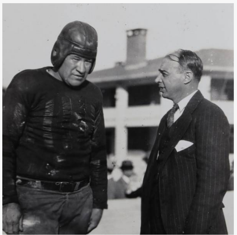
Jim Thorpe, with an unidentified man, in full football uniform, circa 1920s.