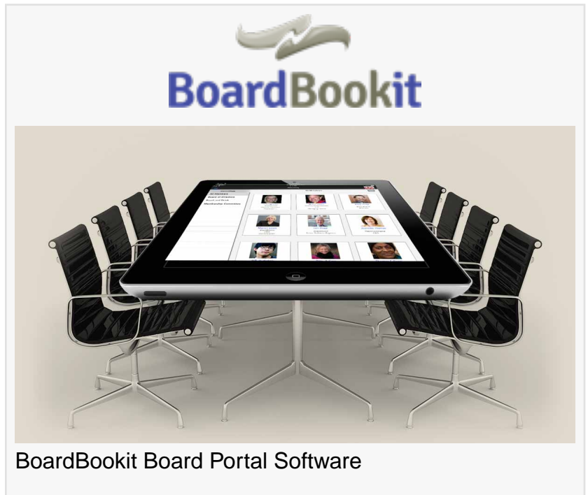
BoardBookit Board Portal Software

PITTSBURGH, PENNSYLVANIA, UNITED STATES, November 27, 2017 /EINPresswire.com/ -- BoardBookit Inc., a leading provider of board portal solutions, announced today that it has released BoardBookit for Android Phone, the sixth component of the BoardBookit platform which allows boards of directors to securely and conveniently access their board information. The BoardBookit Android Phone app is fully functional and provides all of the same features as BoardBookit for Android tablet and other mobile devices. The Android Phone app extends BoardBookit's mobile capabilities to truly be the most portable board portal in the marketplace.