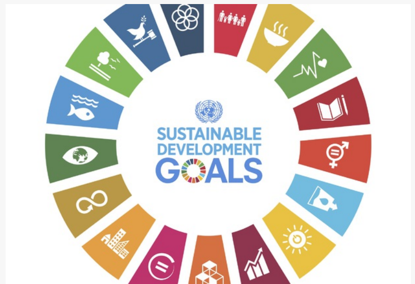
The SDG Circle

This press release can be viewed online at: http://www.einpresswire.com