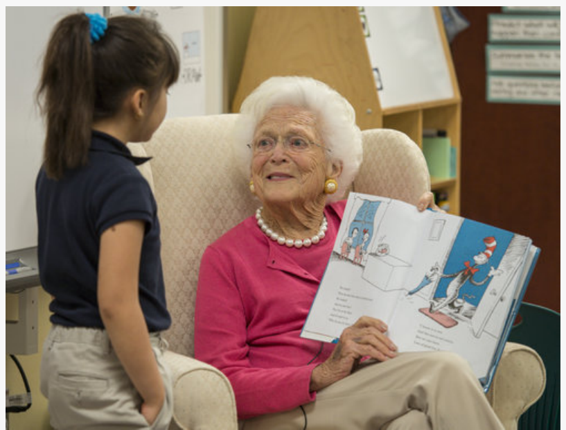
First Lady Barbara Bush with Young Reader

HOUSTON, TEXAS, USA, November 29, 2017 /EINPresswire.com/ -- The Barbara Bush Houston Literacy Foundation is assembling leaders in education, philanthropy and literature to restore the magic of a good book to the children of Houston. "There is nothing more powerful in awakening a child to her or his potential than a wonderful book," said the former First Lady. "We want to inspire Houston's children to become America's future leaders and heroes and reach their fullest potential."