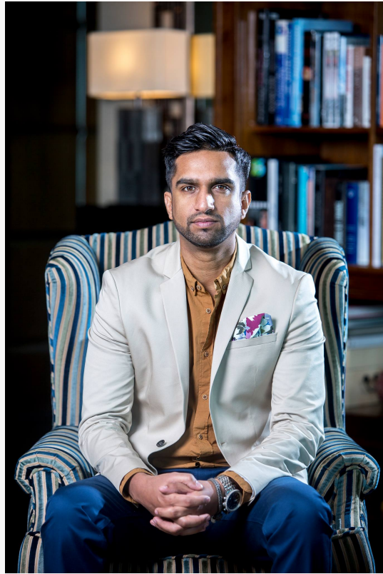
Founder & CEO of Elephant Social