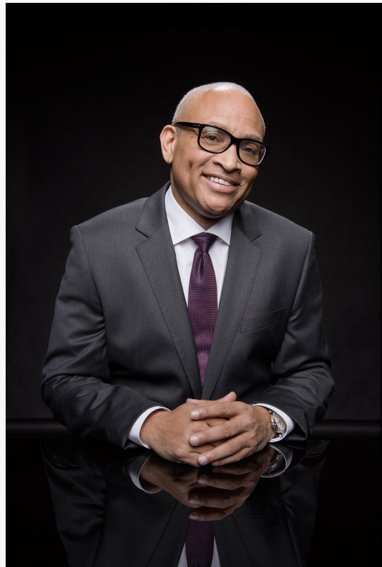
TV host, podcaster and comic Larry Wilmore interviews Rather in Riverside.