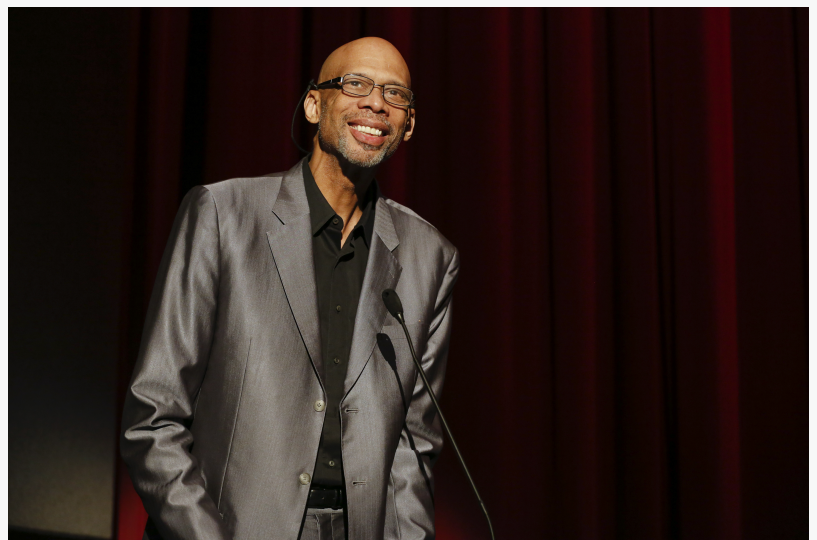
Basketball legend and author Kareem Abdul-Jabbar talks to Rather in Los Angeles.