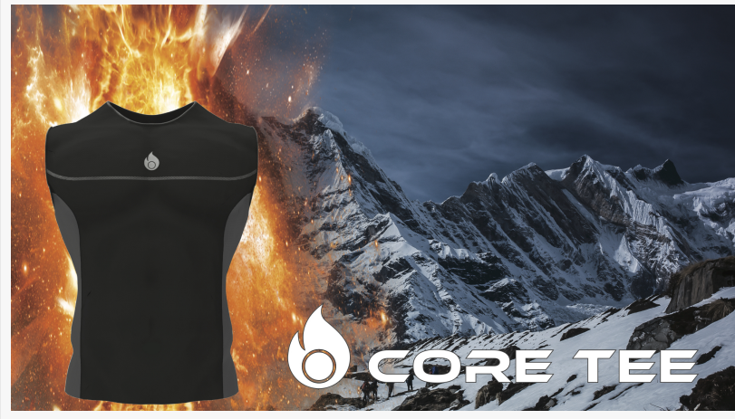
Now available on Kickstarter.

Unlike most base layers, Core Tee has a sleeveless design that offers the mobility to perform all activities with less obstruction. It also provides a double layer of warmth over the torso and the kidney pulse points to warm blood flow. With its "Power Pockets" system, users can add hand warmers over the kidney pulse points to enjoy hours of turbocharged core heat. The superior quality of Core Tee can also be attributed to its