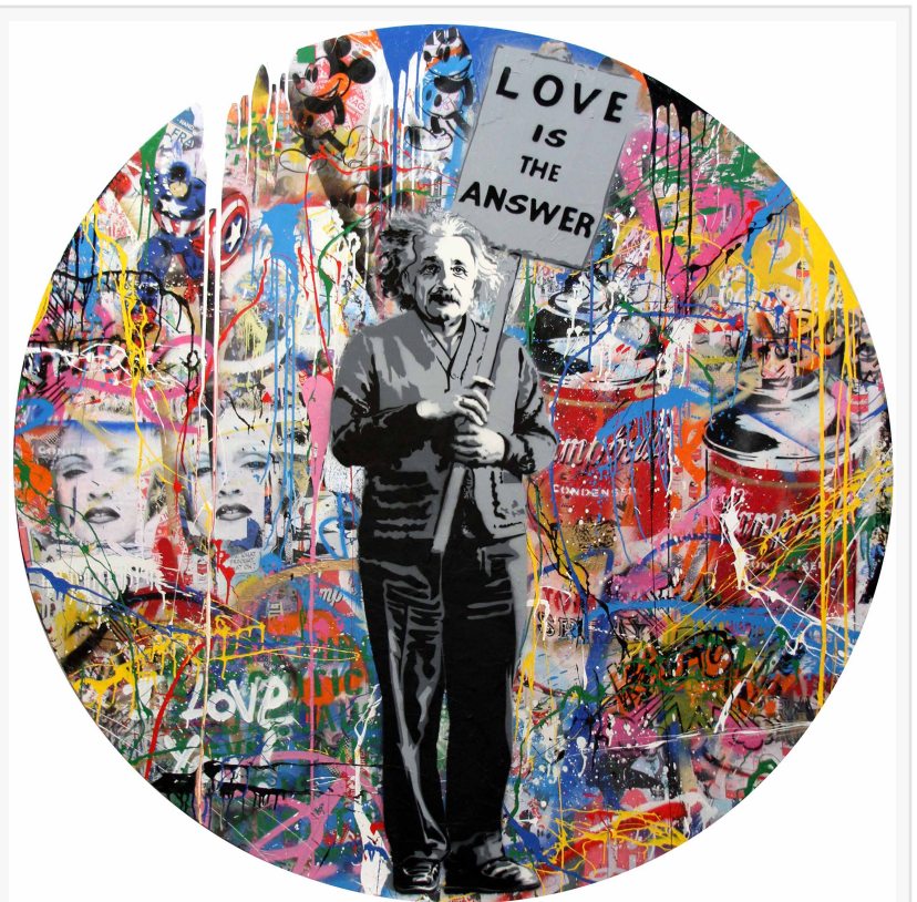
Mr. Brainwash "Einstein" 2017, Stencil and Mixed Media on Round Canvas, 72 x 72 inches

The gallery will exclusively introduce the groundbreaking Birktone Series at Art Miami. The series is executed by innovative contemporary artist and visionary, Cayla Birk. The artist states, "As artists, we eat, breathe, and sleep colors - or the lack thereof. We know their power to evoke emotions and the rest of the globalized world does too. More often than not, we associate colors with different entities; sometimes memories and even people themselves. Through this series, I explored this notion and satirically paid homage to the most famous color company in present day: Pantone. Much of the work that pervades this series depicts pop cultural icons and social phenomenons. Each piece looks as though it is a Pantone swatch from afar, but as you near, the signature Birk designs become more apparent. The subject matter enables the observer to think of color in a new yet austere way."