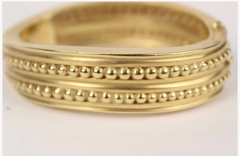
Matte finished 18kt gold elliptical Vahe Naltchayan hinged bracelet with two beaded rows.