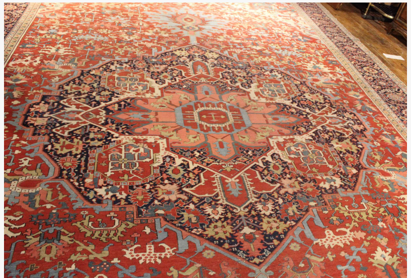
Palace size Ghorevan rug, 19 feet 3 inches by 12 feet 4 inches.