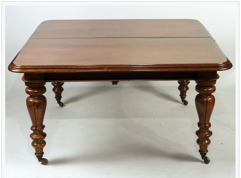
19th century English Victorian mahogany extension dining table with four leaves.

The auction will be led by a fine group of English and American period furniture, sterling silver flatware sets by major makers, fine estate jewelry pieces, gorgeous plush rugs, original artwork and gift-worthy decorative accessories, such as a first-half 19th century Smith & Son