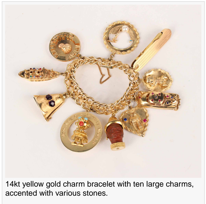
14kt yellow gold charm bracelet with ten large charms, accented with various stones.