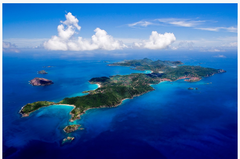
Aerial View of St Barts