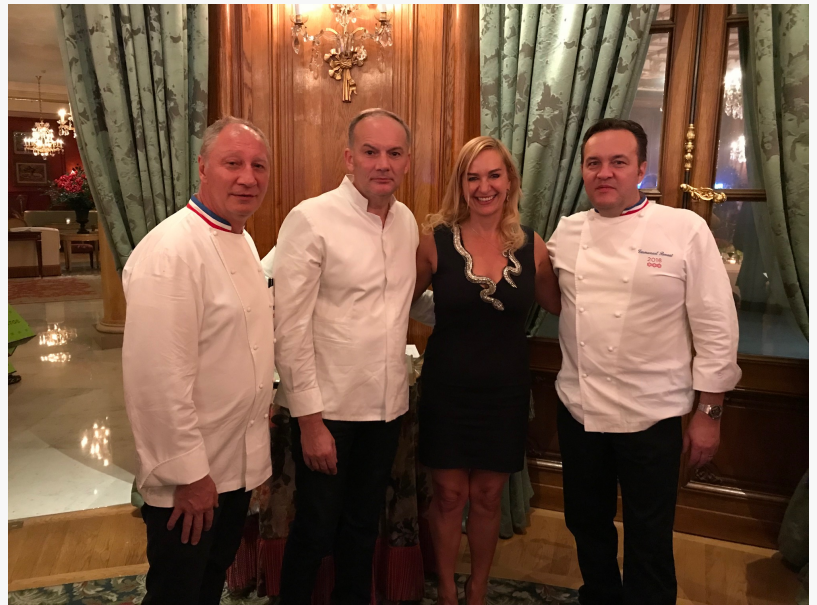
3 Chefs with 9 Michelin Stars

NEW YORK, UNITED STATES, December 6, 2017 /EINPresswire.com/ -- The stunning paradise island of St Barts hosted a spectacular night to celebrate the re-opening of the island following the aftermath of hurricane Irma. Each year Saint Barthélemy presents the St Barth Gourmet Festival on the island in November. This year due to the exceptional circumstances the event was held in Paris on Friday 1st December. This gastronomic feast took place at the luxury 5-star hotel Le Bristol on the Rue du Faubourg Saint-Honoré. Le Bristol is managed by the very exclusive Oetker Collection which also manages the famous Eden Rock Hotel in St Barts.