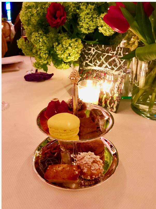
St Barts Night at Le Bristol