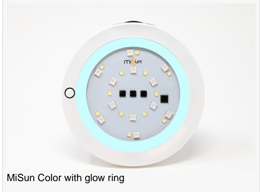
MiSun Color with glow ring