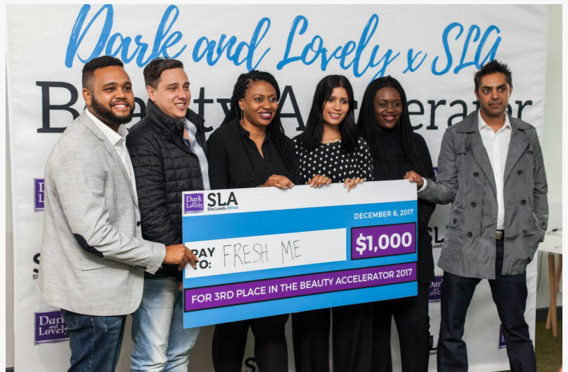
Third place winners FreshMe, South Africa