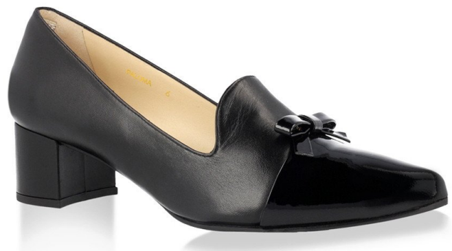
UKIES Paloma Black Heel