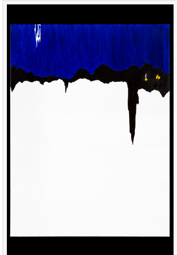
Wilford presents tribute to classic Abstract founders

Display hours are: Dec. 6-9th (Wednesday through Saturday) from 9 am to 8 pm, in the Cowrie #2