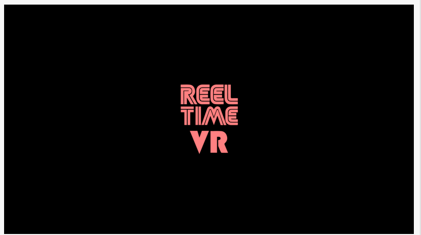
ReelTime VR Logo