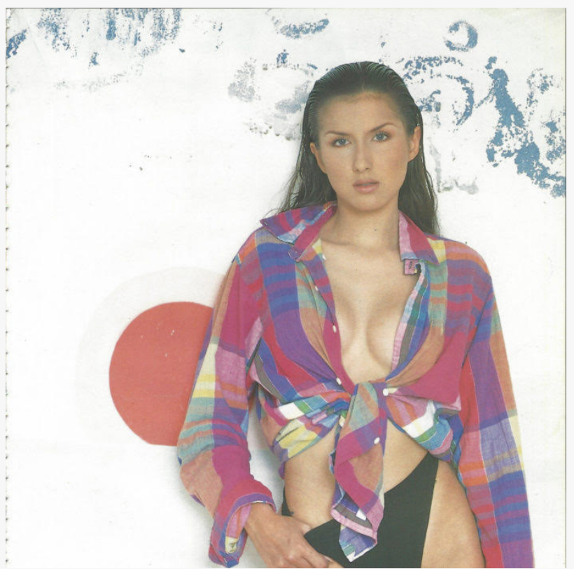
ReelTime Vrs Front Montgomery