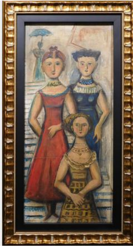
Oil on laid paper attributed to Italian artist Massimo Campigli (1895-1971).

An untitled (Hooded Figures Driving) oil on canvas attributed to Philip Guston (Can., 1913-1980), depicting hooded figures driving through an industrial or otherworldly landscape, has an estimate of $40,000-$60,000. Also, an abstract oil painting attributed to Hans Hofmann (Germ./Am., 1880-