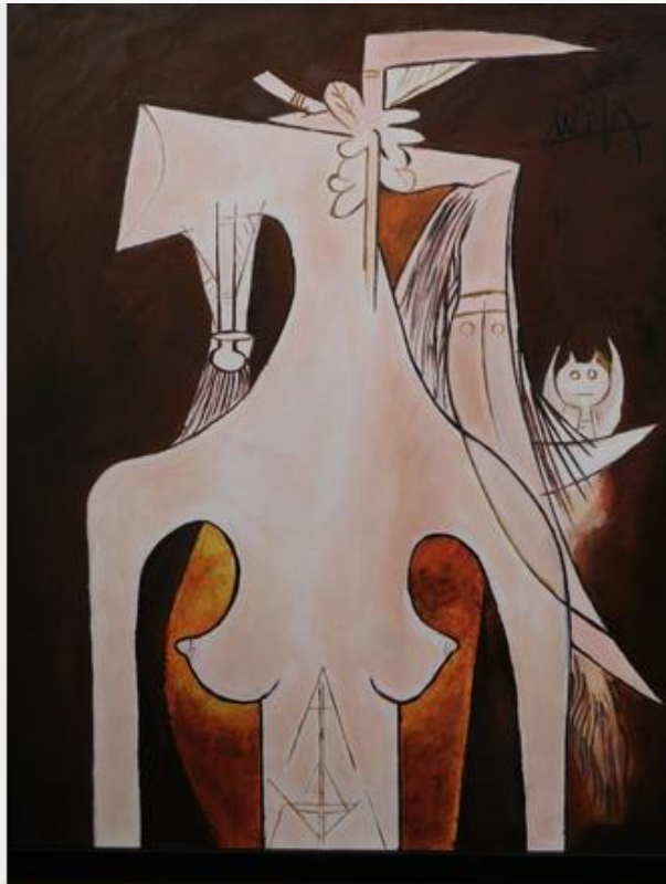
Oil on canvas painting attributed to Cuban-born artist Wilfredo Lam (1902-1982).