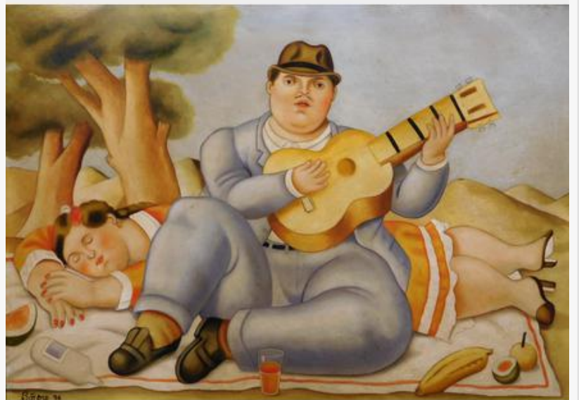
Oil on paper attributed to Colombian artist and sculptor Fernando Botero (b. 1932).