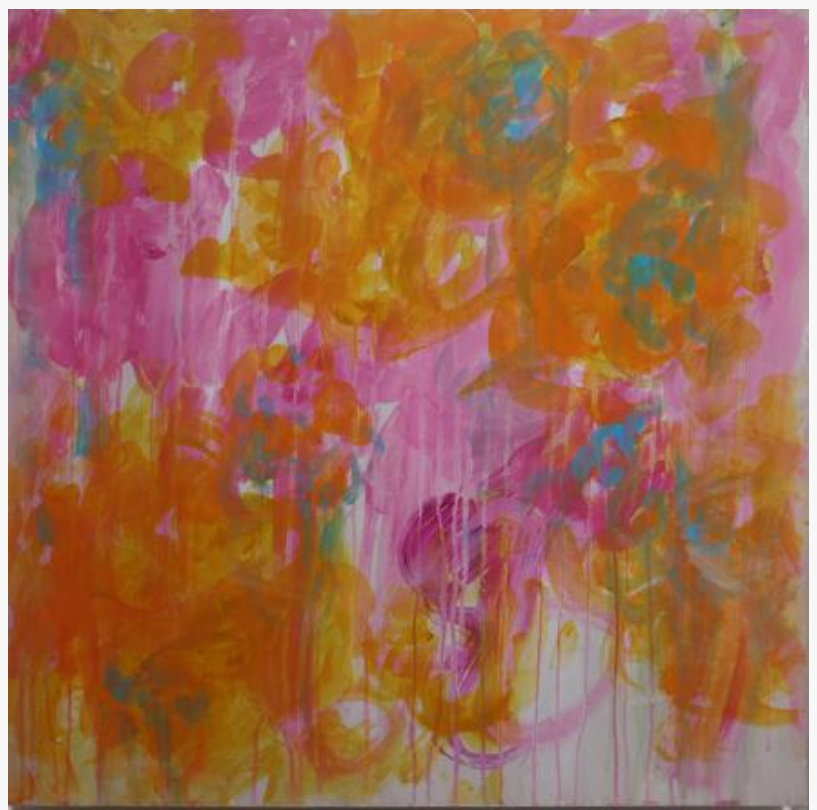
Original oil on board abstract floral painting by Cy Twombly (Am., 1928-2011).

The oil on paper attributed to the Colombian figurative artist and sculptor Fernando Botero (b. 1932) is titled En El Parque (In the Park) and is artist-signed lower left and dated ("94"). The 11 ¾ inch by