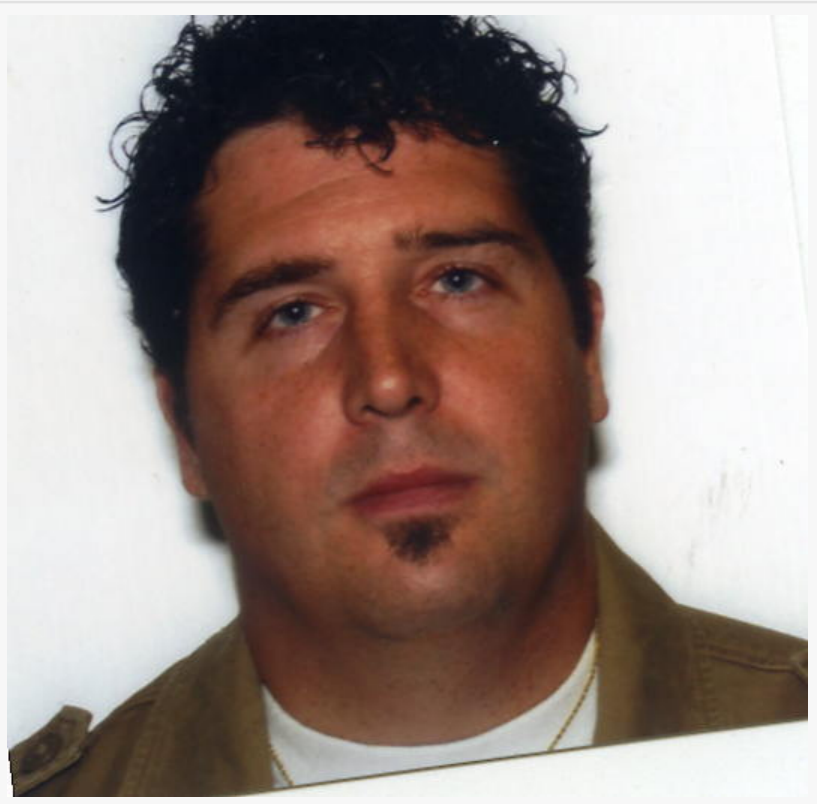
Teamwork Makes the Dreamwork!

TR has a concept to reach out, connect, explore and promote all talent because without talent and entertainment there is no imagination and without imagination we cannot progress forward. Music is undeniably the fuse between our body mind and soul and it is credential that we appreciate the confidence and talent behind gifted artists. So, by listening to our favorite artists, what makes them so special to another musician that hasn't had the opportunity in stepping into the spotlight? Is it the millions of dollars contracts, endorsements and advertising that we instantly connect to the latest track being played on the radio? Is it the latest fashion trends worn by our most popular artists and celebrities all over the latest gossip magazines which melts our hearts and puts a little fire back in our confidence? What is it that makes us. connect ourselves to artists within the entertainment industry? TR Talent Magazine