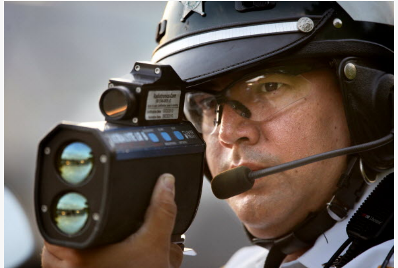
Speeding violations are a common infraction that can cost motorists time and money in the long run.

This press release can be viewed online at: http://www.einpresswire.com