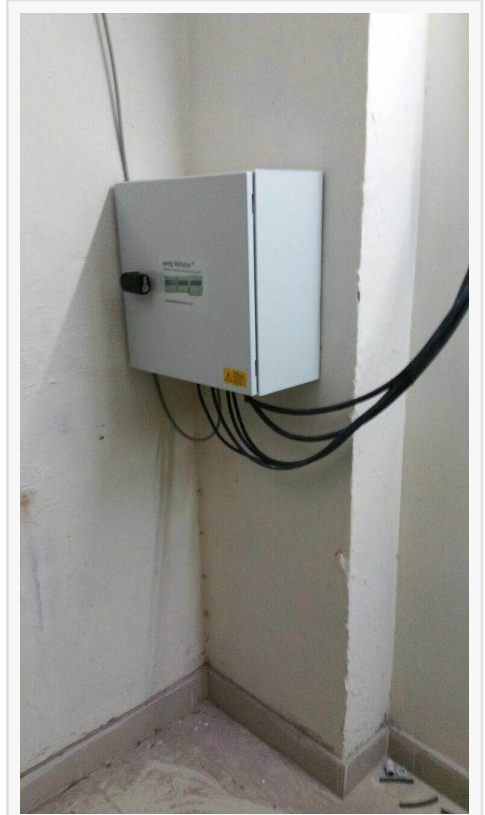
Earthquake Detectors installed at Haryana's Secretariat

This press release can be viewed online at: http://www.einpresswire.com