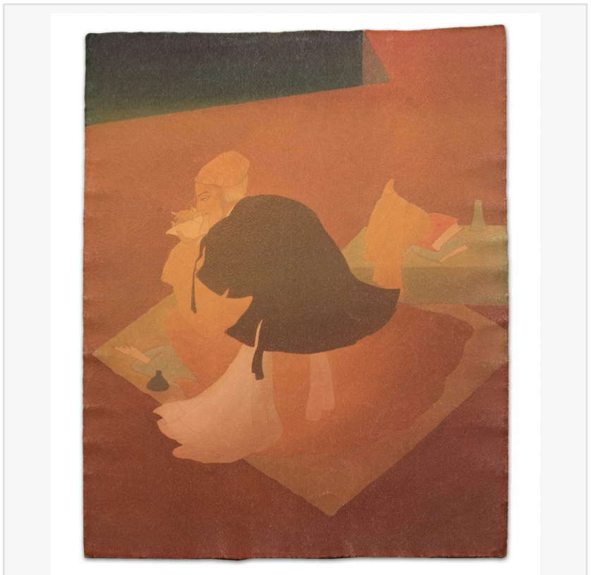
Watercolor painting by Pakistani artist Abdur Rahman Chughtai (1897-1975), titled Poetic Expressions.

The nine-piece Reed & Barton sterling silver tea and coffee service in the Francis I pattern has an overall weight of 383.39 troy ounces and all pieces boast a gold wash interior and are hallmarked for