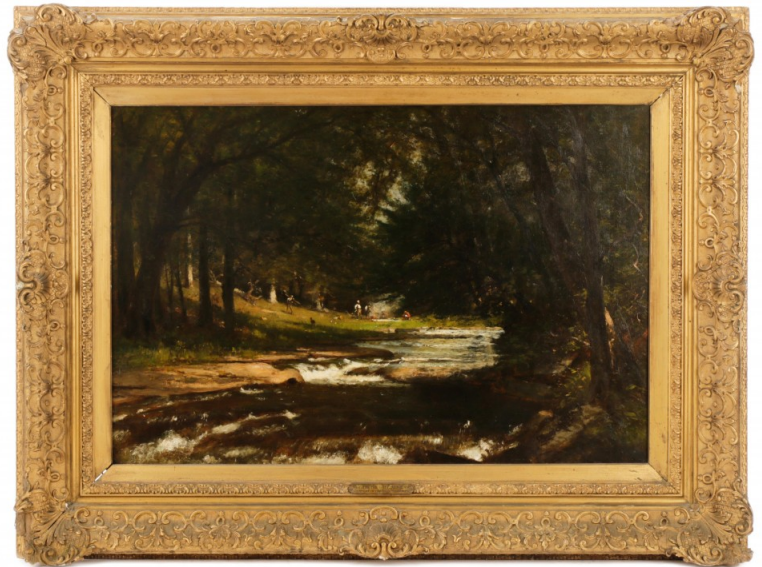
Oil on canvas landscape painting with figures by Worthington Whittredge (Am., 1820-1910).