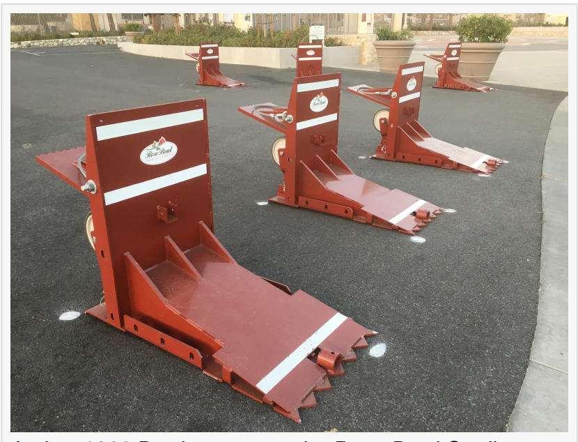
Archer 1200 Barriers protect the Rose Bowl Stadium

The barriers will support a robust security program at the year-round venue which hosts large-scale outdoor events