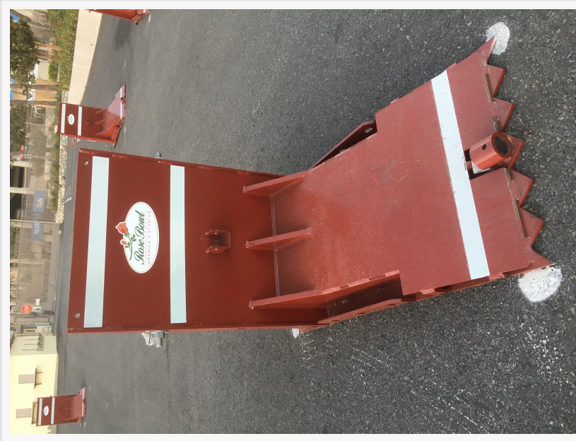
Archer 1200 Barriers protect the Rose Bowl Stadium

About Meridian Rapid Defense Group MRDG is headquartered in Pasadena, CA and operates in the U.S., Europe, Asia and Australia as perimeter security specialists. MRDG develops anti-vehicle barrier systems that are engineered for speed of deployment. The flexibility of the system allows tactical or military forces to quickly secure politically, economically or environmentally important sites for short and long durations. Their product line is focused on anchored and unanchored portable