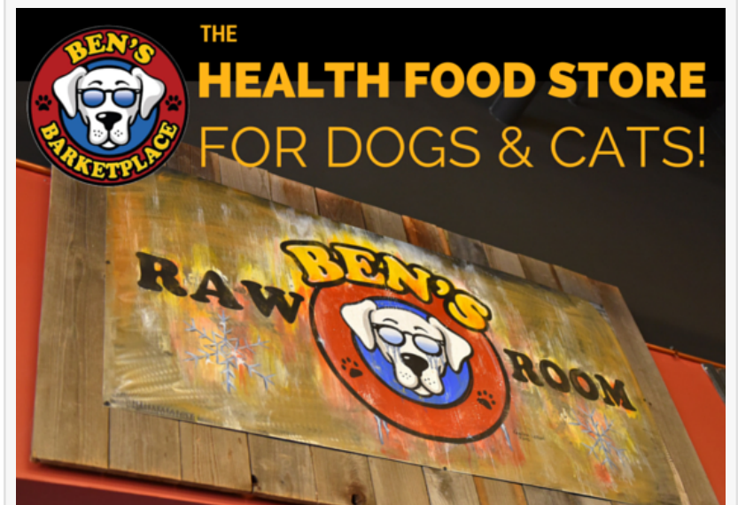
The Famous Raw Room