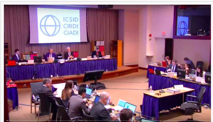
CAFTA Heraing Room, World Bank, Washington, DC