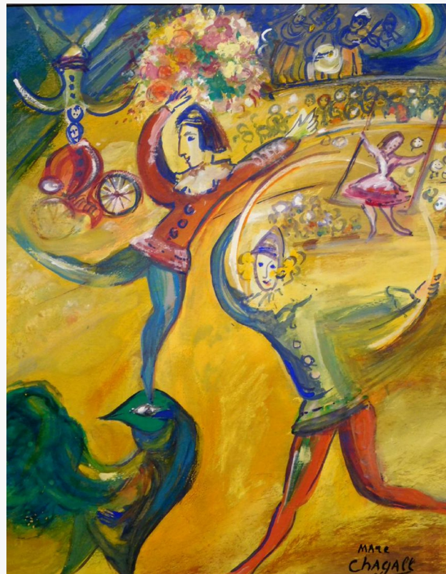
Gouache on paper in the manner of Marc Chagall, titled Circus Acrobats ($6,600).