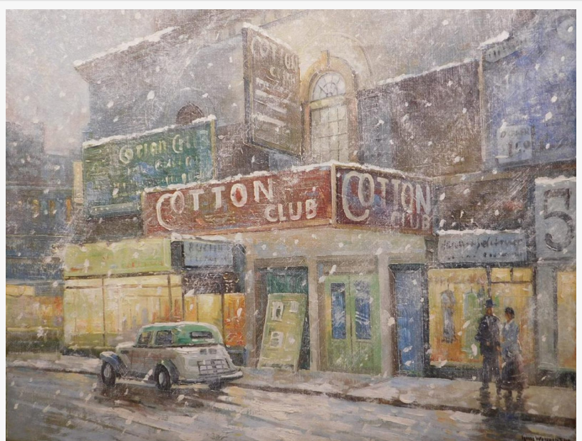
Oil on canvas snowy New York streetscape by Guy Carleton Wiggins, titled The Cotton Club ($8,100).

Bruce Wood Woodshed Art Auctions (508) 533-6277 email us here