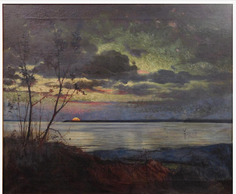
Luminist style late autumn landscape painting attributed to Jasper F. Cropsey ($38,400).

The untitled (Autumn Sunset) oil on canvas work was presented in a later frame and was signed lower right and dated 1878. It was a large work – 45 inches by 51 inches – and a prime example of Cropsey's mature work. Mesmerizing and beautiful, it showcased his standard elements from the period: tall nearly bare trees, tranquil blue water, a radiant sunset and warm billowing clouds.