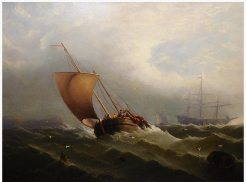
Oil on canvas marine rendering by British artist Edward Moran, titled A Shipwreck ($12,000).