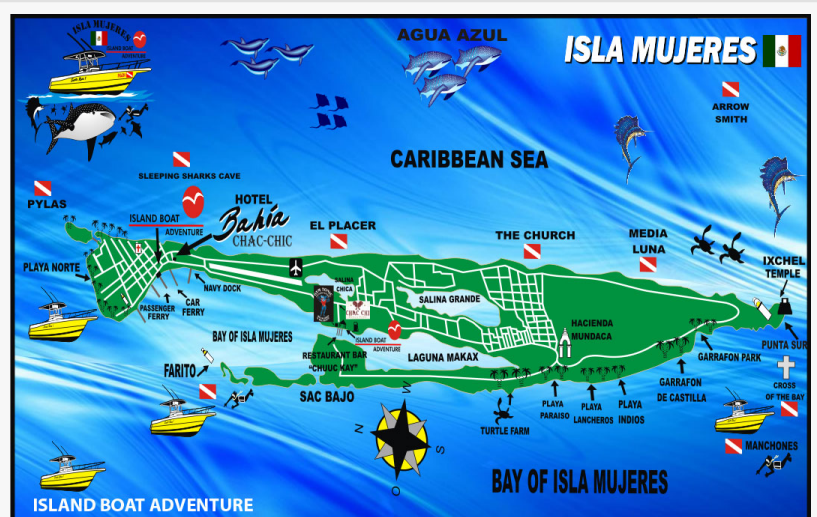
Isla Mujeres awaits you!