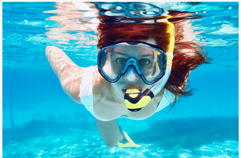
Put Yourself in this picture