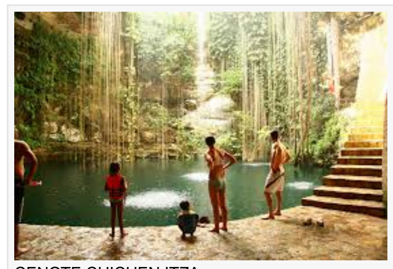
CENOTE CHICHEN ITZA

NEXT YOU'LL VISIT THE COOL REFRESHING WATERS OF FAMOUS IK'KIL CENOTE (AGAIN WITHOUT THE HERDS WHO HAVE JUST LANDED AT CHICHEN ITZA) RELAX IN THE REFRESHING COOL, CLEAR CENOTE WATERS INSIDE THIS AMAZING CAVE -LIKE EXPERIENCE. (ESPECIALLY NICE ON A HOT SUMMERS DAY!)