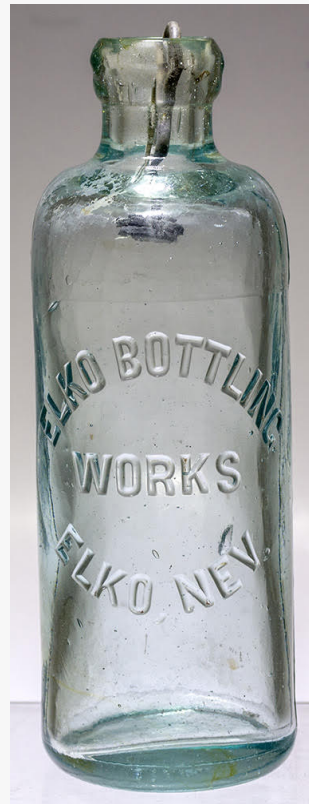
Rare aqua mint hutch style Elko Bottling Works (Elko, Nev.) soda bottle, circa 1899-1901