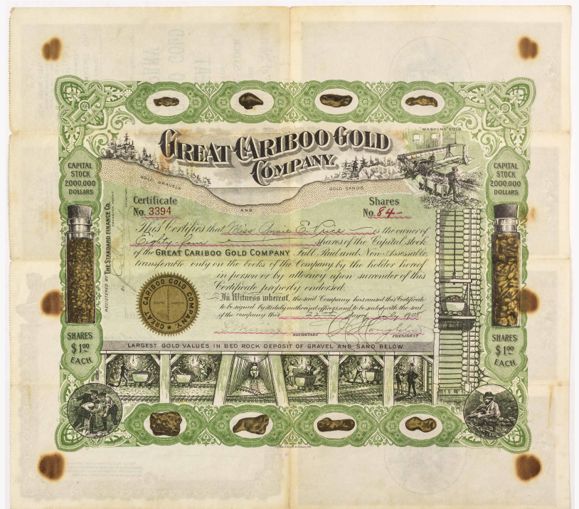
1908 stock certificate for the Great Cariboo Gold Co. (British Columbia, Canada) for 84 shares.