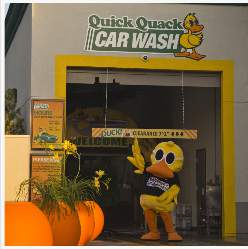
Quackals the Duck Mascot

About Quick Quack Car Wash Quick Quack Car Wash has forty-five locations in Arizona, Utah, California, Texas, and Colorado. The Quick Quack Car Wash concept grew from a desire to get cars clean using the best technology and to do it extremely fast. The high-quality and environmentally-friendly car washing system uses neoprene foam, soft cloth and filtered, recycled water. The customer stays in their vehicle while being automatically guided through the car wash where the vehicle is soaked,