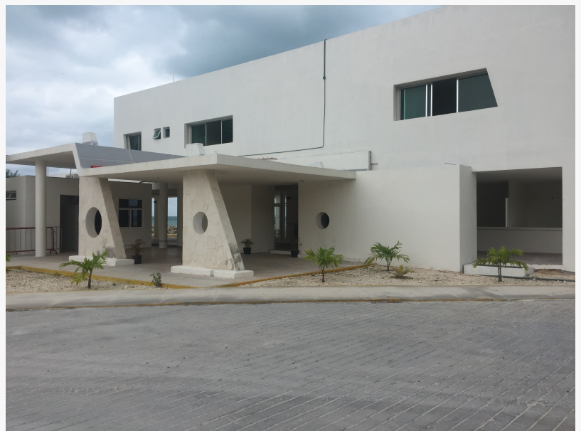
NEW MARINA PUNTA SAM

BOTH CARIBBEAN CONNECTION AND CANCUN WHALESHARK TOURS ARE HIGHLY RATED ON TRIP ADVISOR SO POTENTIAL CLIENTS CAN HAVE