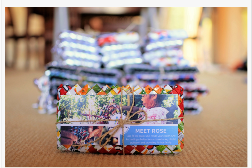
Stack of Mother Erth Clutches Ready to Send to Golden Globe Nominees

3 - Its Look. Mother Erth handbags make a bold, and uniquely beautiful statement. People who carry the bags often get asked about them wherever they go.