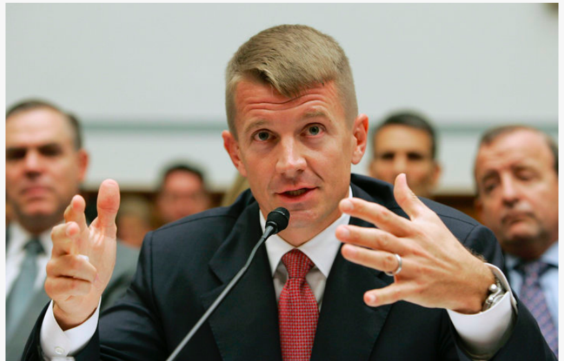
Eric Prince Former Navy Seal Officer