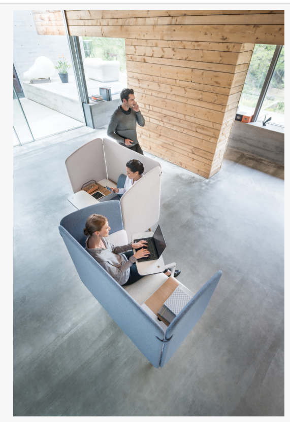
Open for modern forms of work: Sedus se:works

Sedus products are developed in the company's own research and development centre, which attracts experts from the fields of workplace design, ergonomics and wellbeing to create its most innovative solutions. Holger Jahnke: "For a workplace to be future proof, it should be responsive to changing needs and activities, and must offer users the freedom to choose where and how to work. Our flexible and intelligent workplaces address this issue directly, offering the perfect environment for private work, communication, collaboration and relaxation. The modular design of Sedus tables, workstations and storage systems allows them to adapt quickly to changing requirements. Together with our intuitive, user-friendly task seating, it is possible to create ergonomic, productive solutions that are ideally suited to fast moving environments."