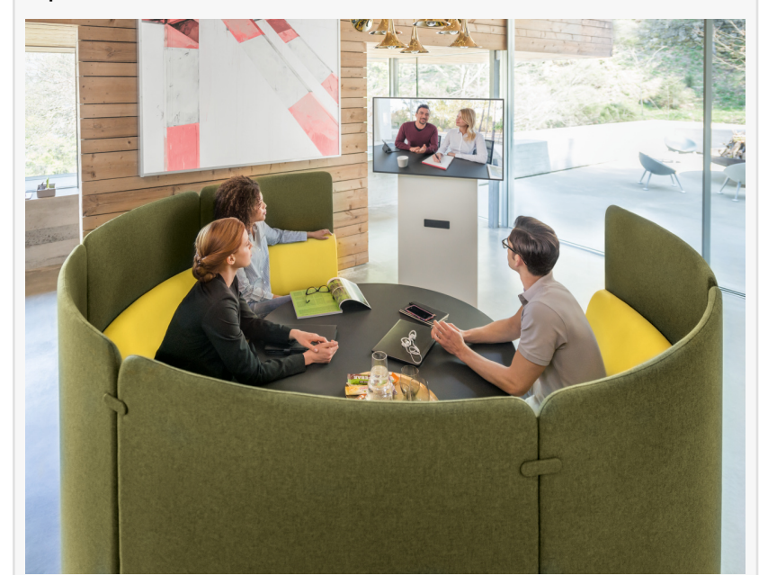
Sedus se:works - designed for working. Alone and in a team.