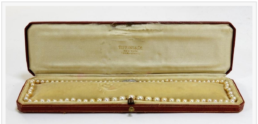
Circa 1900 17-inch strand of pearls by Tiffany & Company, with diamond-encrusted platinum clasp ($10,625).

Two Chinese lots posted identical selling prices of $3,438. One was a Ming dynasty archaistic bronze vase of Hu form, decorated with a banded pattern in relief over a stylized Greek key pattern background, 8 ¼ inches tall. The other was a watercolor on paper painting of radishes, with the image