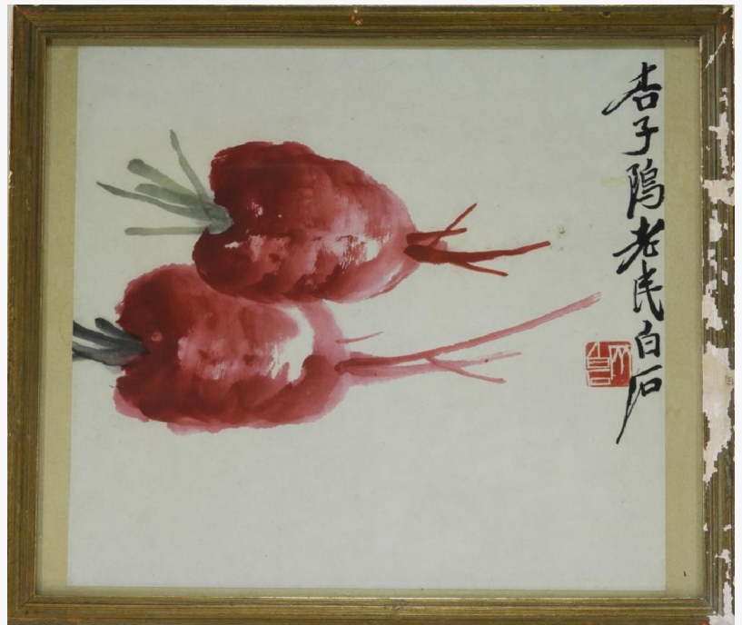
Chinese watercolor on paper of radishes, with a calligraphic poem, 14 inches by 16 inches ($3,438).

This press release can be viewed online at: http://www.einpresswire.com