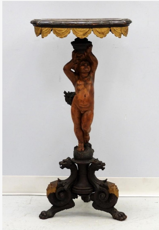
Italian Baroque carved walnut figural table stand, late 18th or early 19th century ($5,000).