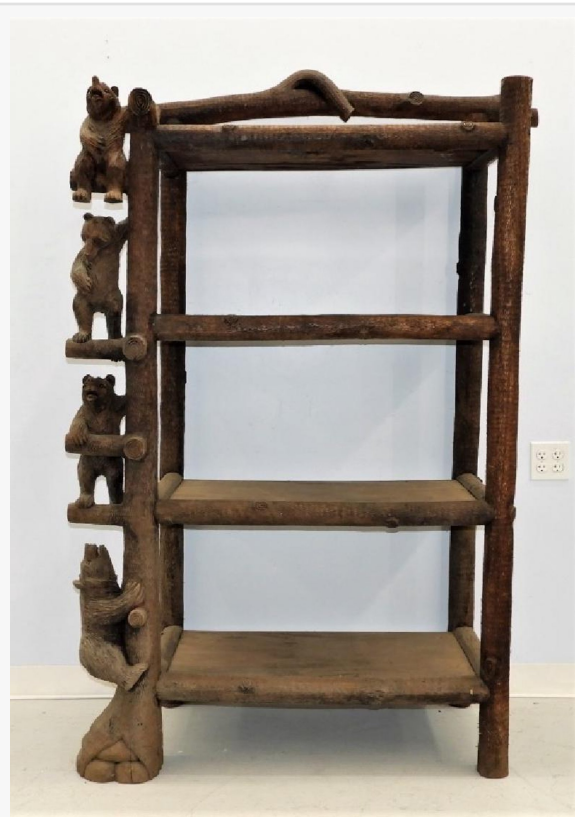
German 20th century Black Forest bookcase shelf with bear cub figures, 72 inches tall ($6,875).

Travis Landry Bruneau & Co. Auctioneers (401) 533-9980 email us here