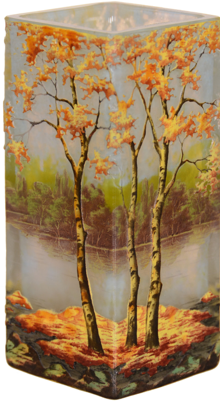
Daum Nancy French cameo art glass, 4.75 inches tall, with gorgeous colors and a fall season decor.

Collectors of Royal Bayreuth are in for a treat. Lots will include a 6 ¼ inch tall unmarked candlestick holder depicting a full figure fox in a colorful dinner jacket; a 4 ¾ inch tall turtle lemonade pitcher with blue mark; a 7 ¼ inch tall Santa Claus lemonade pitcher with blue mark; a 6 ½ inch tall snake water pitcher of excellent quality, rare with a blue mark; and an unmarked 8 ¼ inch tall