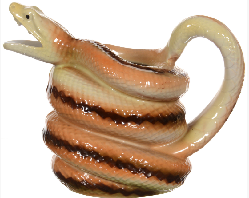
Royal Bayreuth 6.5-inch-tall snake water pitcher of excellent quality, rare and with a blue mark.