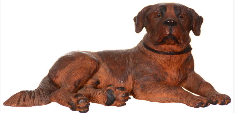
Late 19th or early 20th century hand-carved Black Forest wooden dog, 4.5 inches tall.