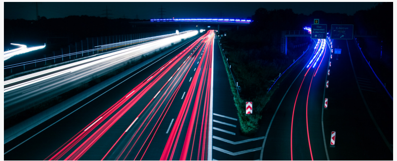
Friendly TLC Rentals & Leasing - Rent TLC Car

One danger that exists late at night and especially on Friday or Saturday evenings is drunk drivers.